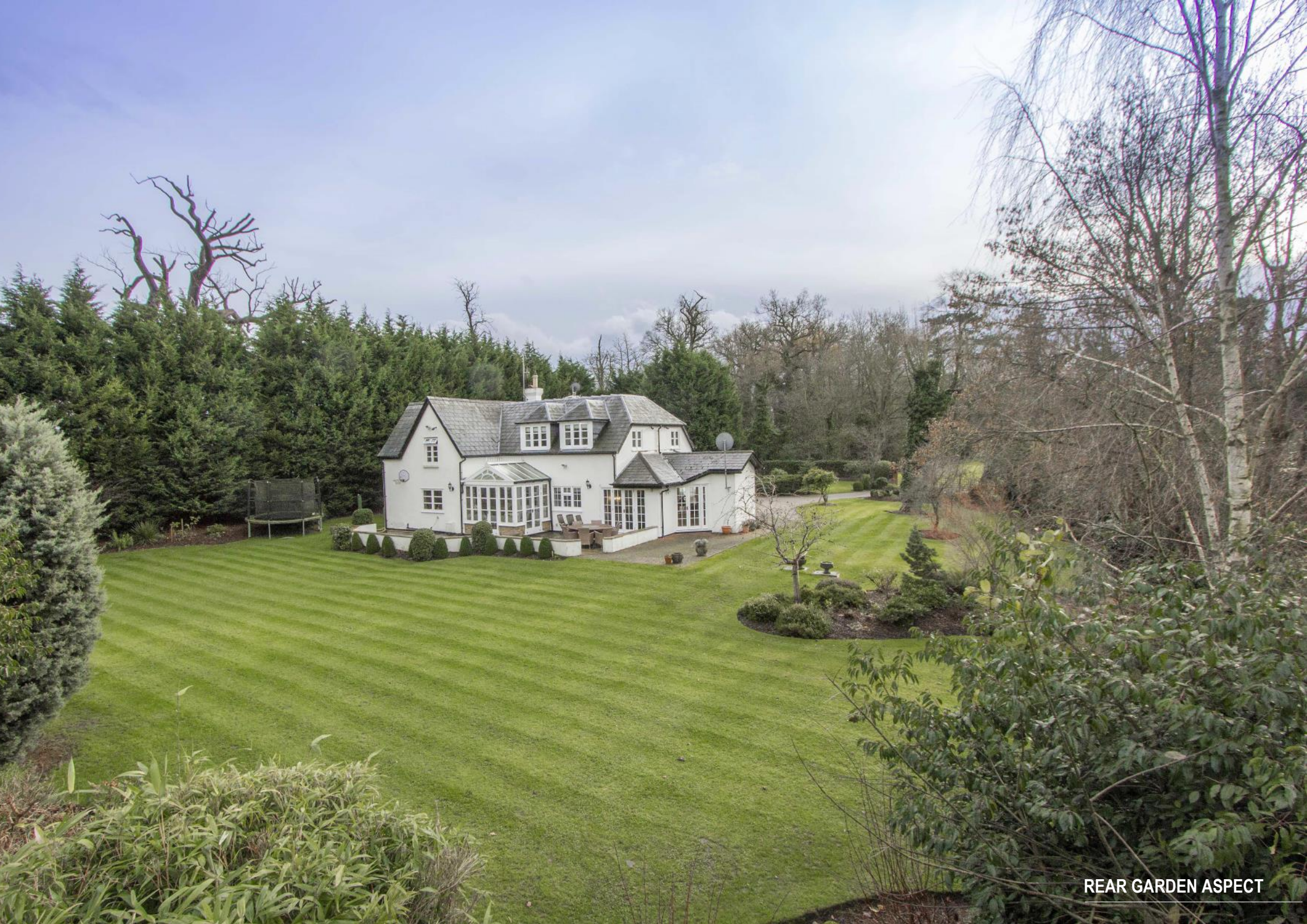
REAR GARDEN ASPECT