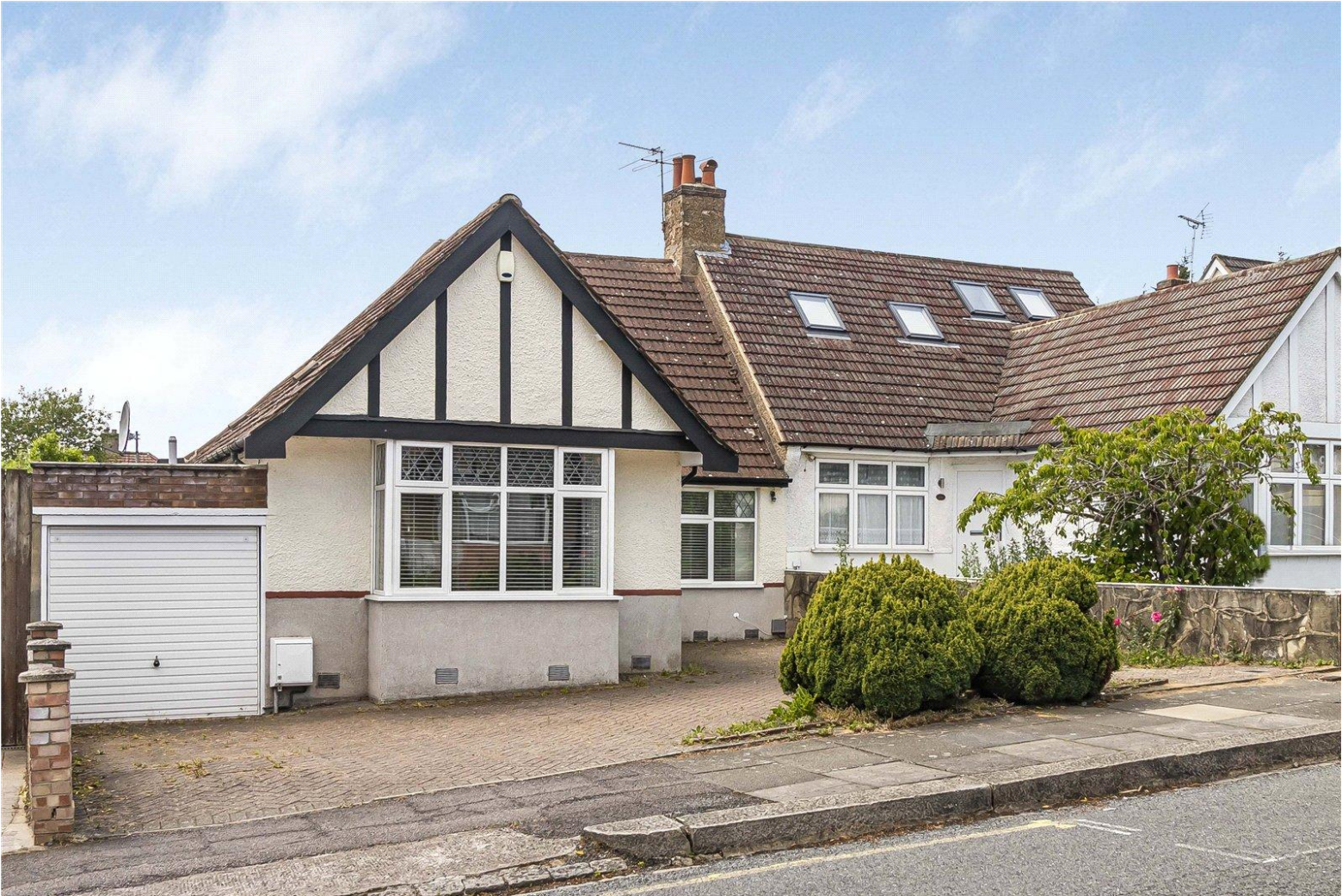
Normandy Avenue Barnet, Herts, EN5 2HS