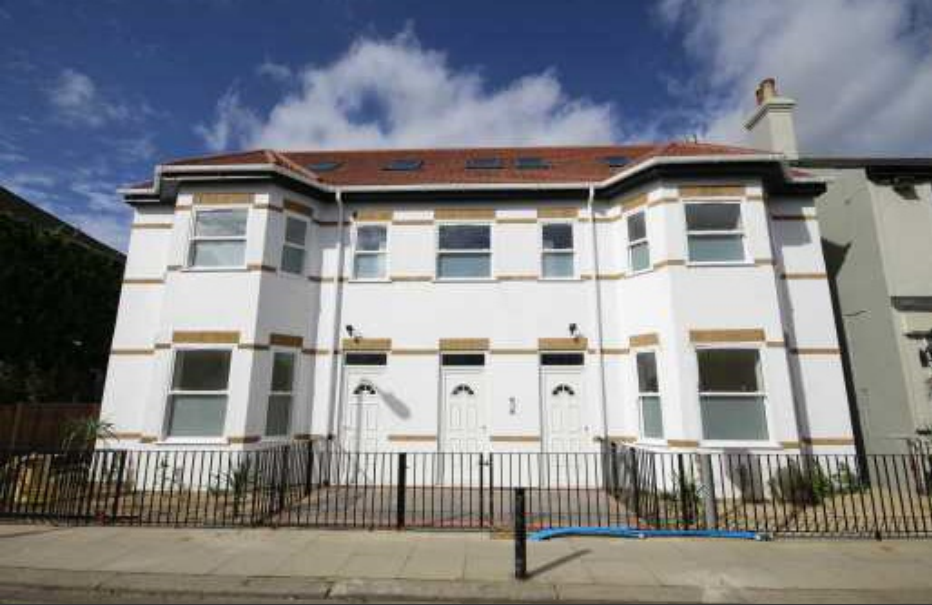
Apartment 2, 7 Alston Road High Barnet, Hertfordshire EN5 4ET