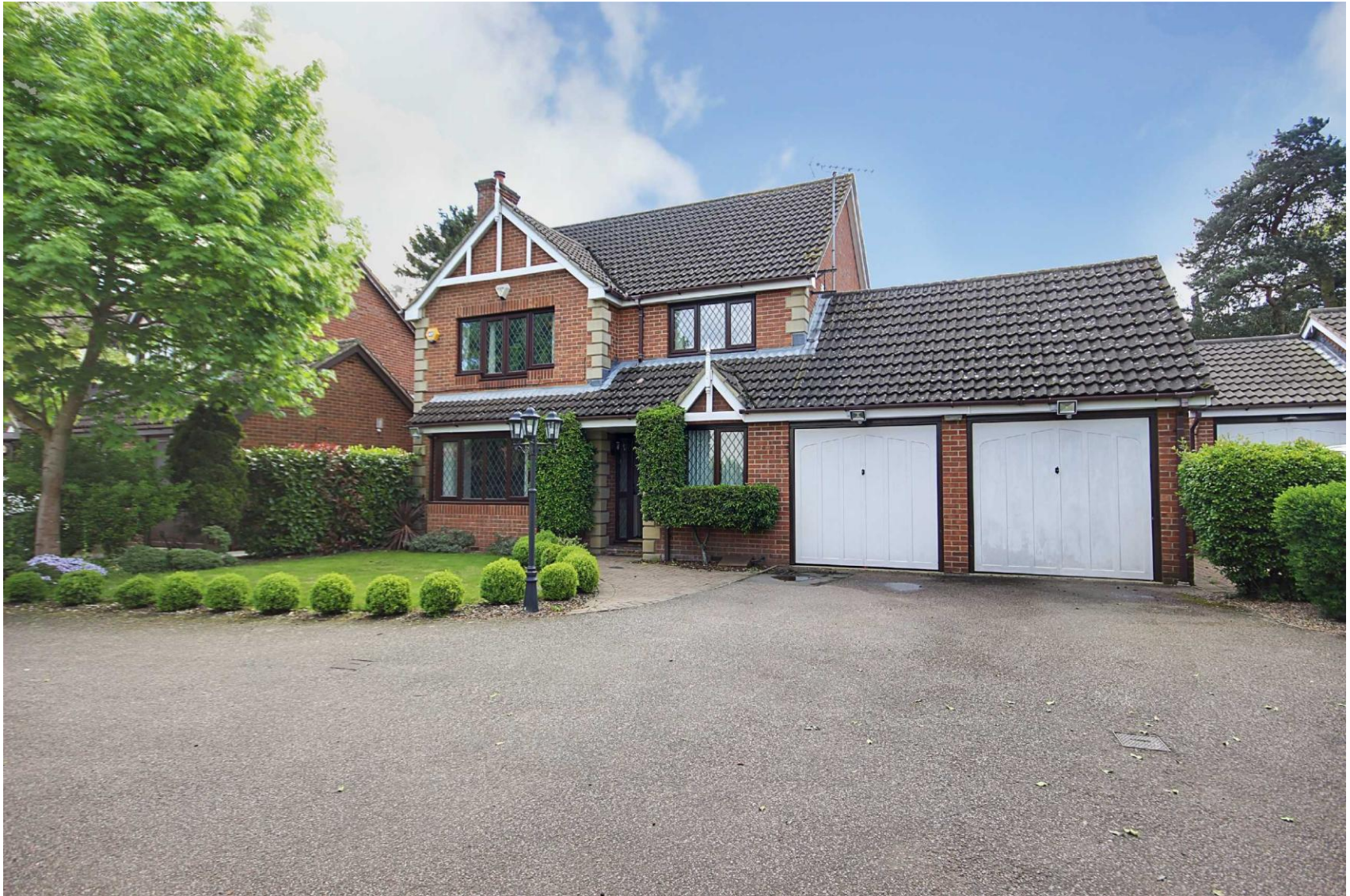
Chester Close Little Heath EN6