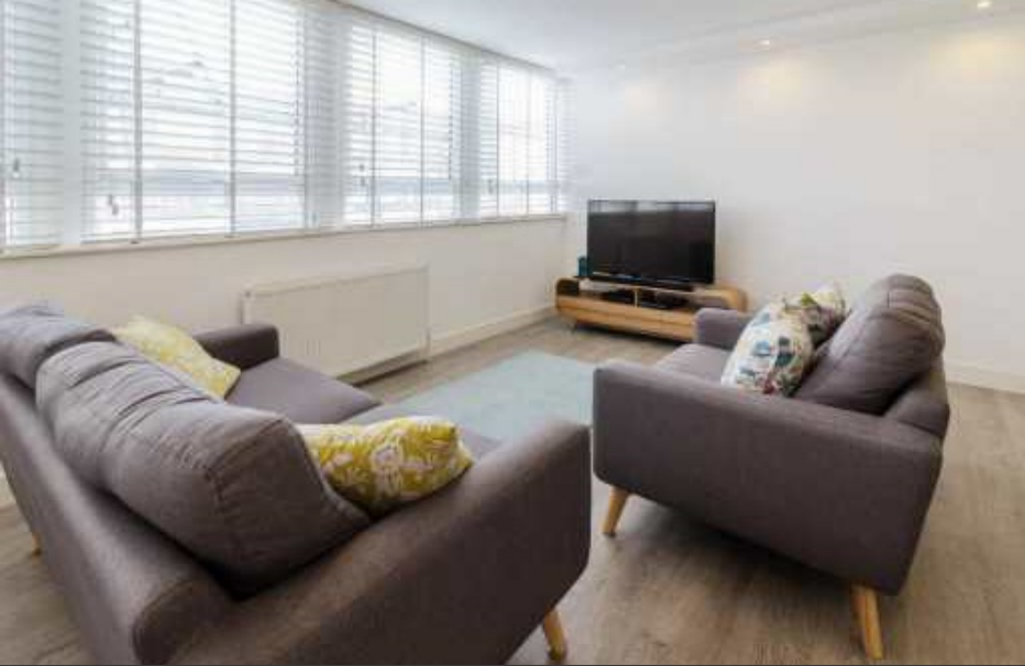
Flat 1, 141a High Street High Barnet, Hertfordshire EN5 5UZ