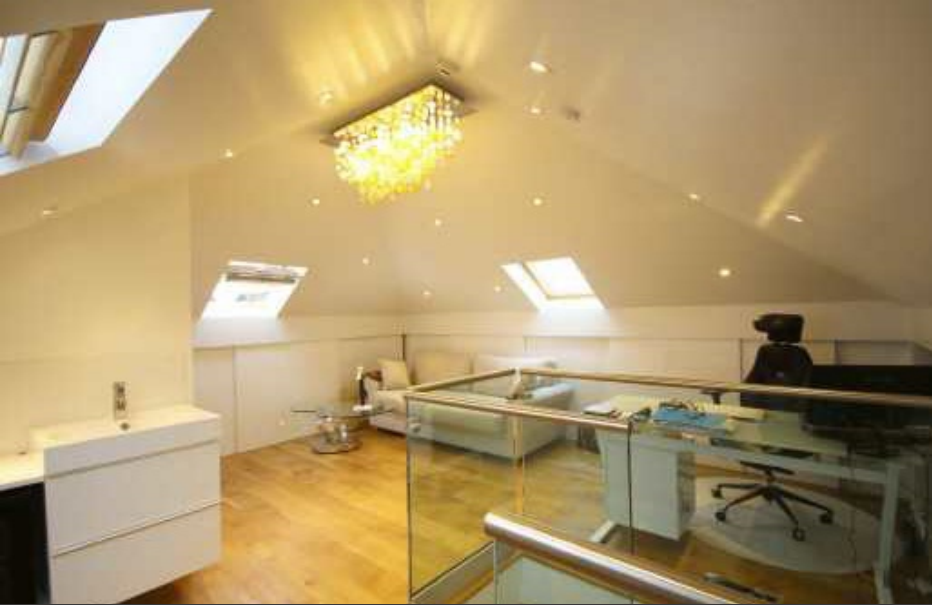
Tivoli, 62 Hadley Road New Barnet, Hertfordshire EN5 5QS