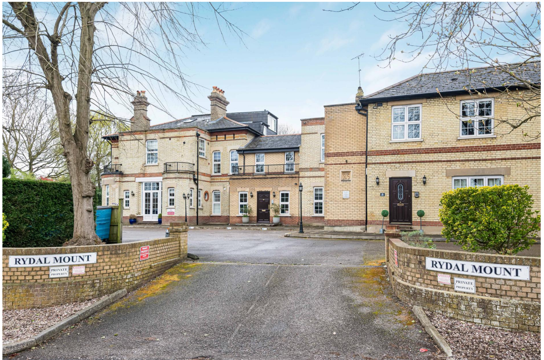
Rydal Mount Santers Lane, Potters Bar EN6