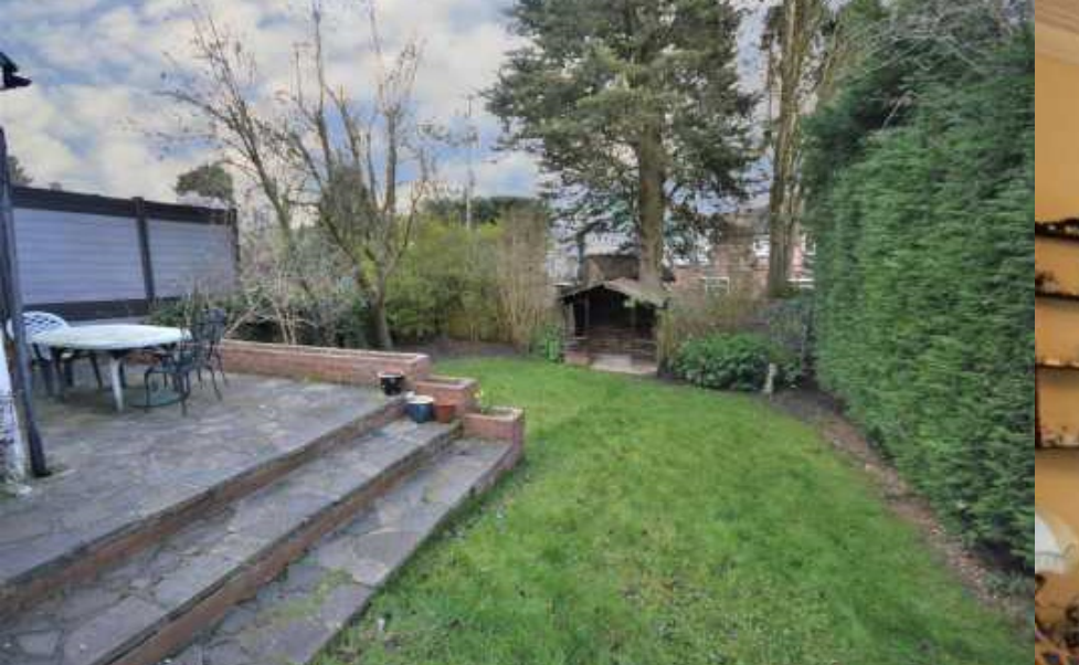
12 Friars Avenue Whetstone, London N20 0XH