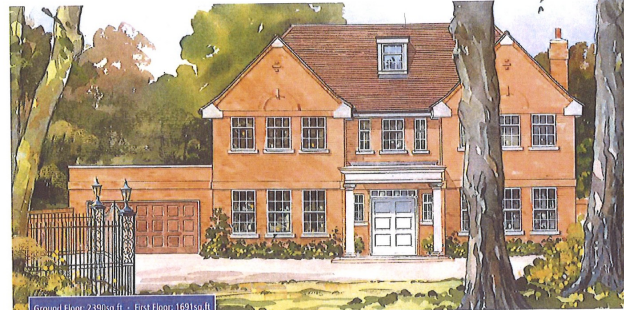
Ground Floor: 2390sq ft - First Floor: 1691sq ft Second Floor: 1350sq ft - Total: 5431sq ft