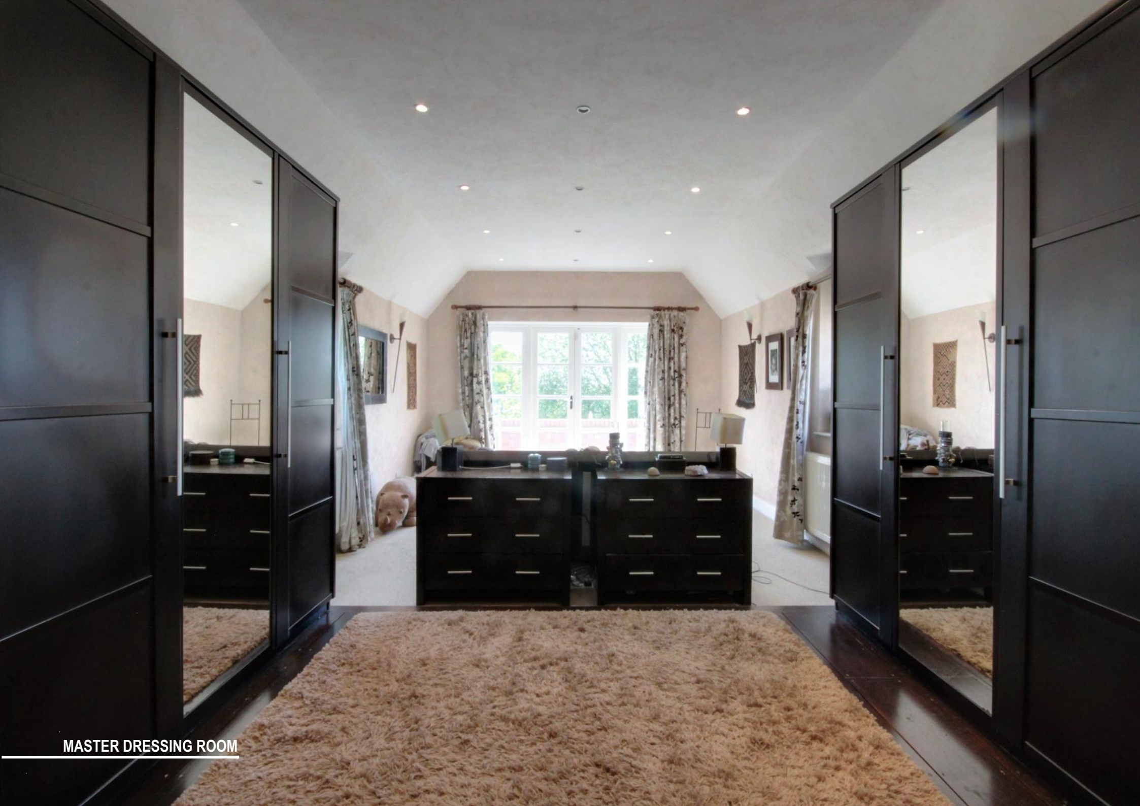
MASTER DRESSING ROOM