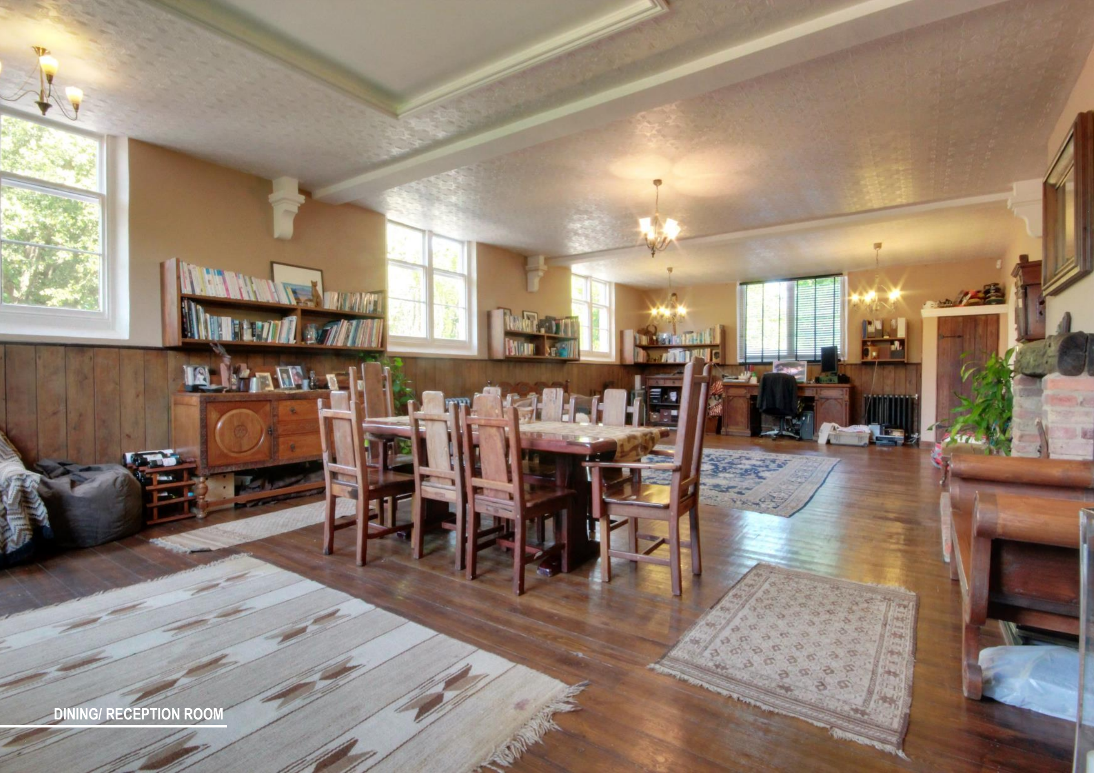
DINING/ RECEPTION ROOM