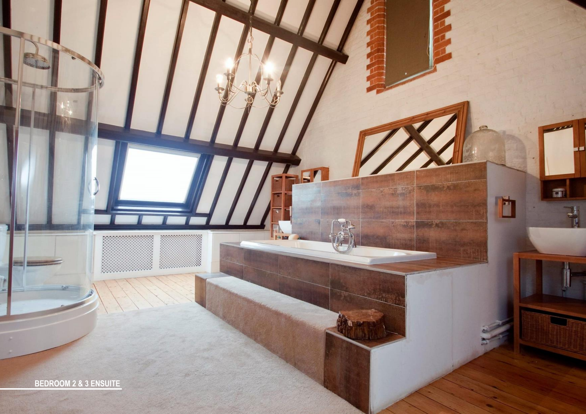
BEDROOM 2 & 3 ENSUITE