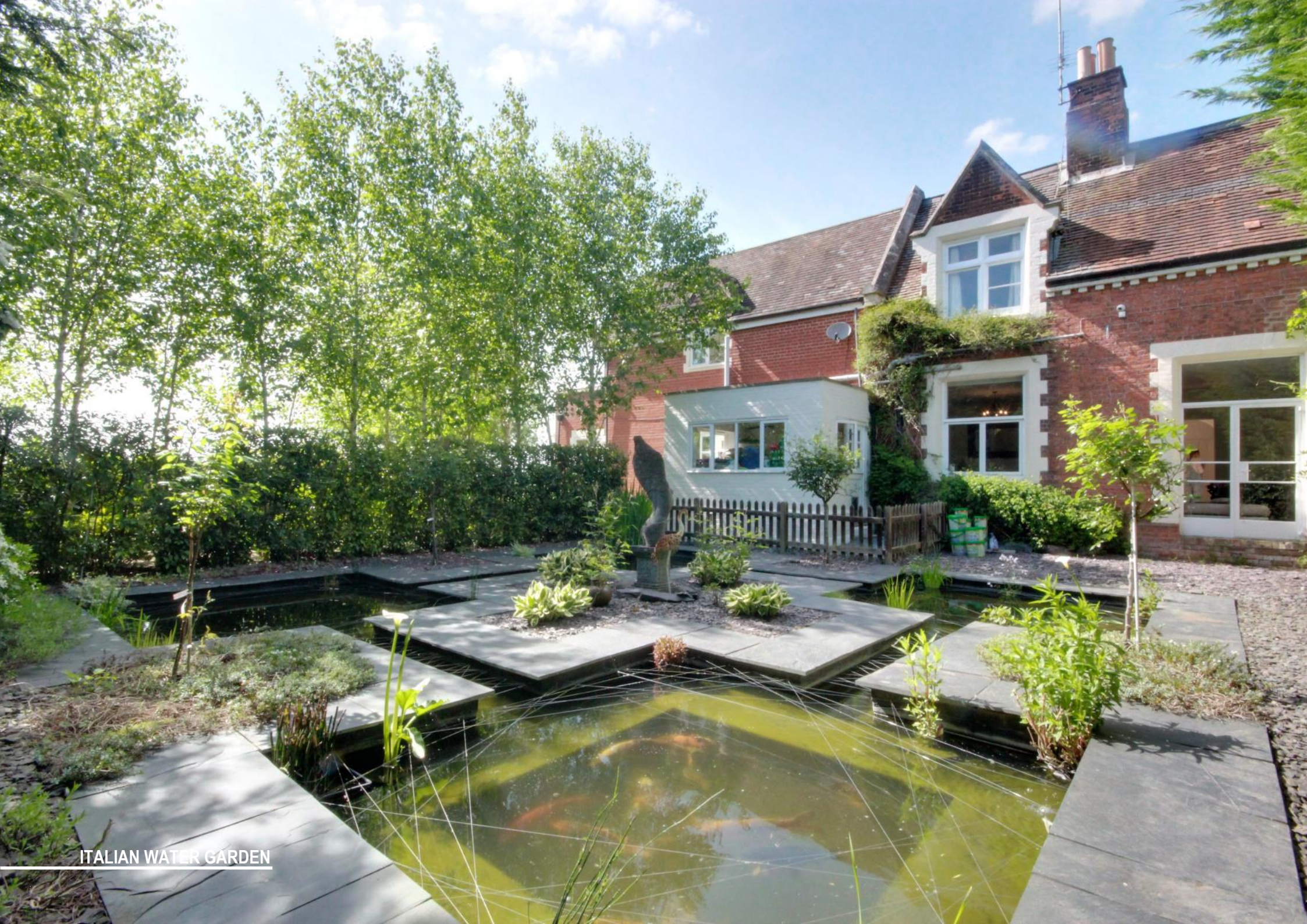
ITALIAN WATER GARDEN