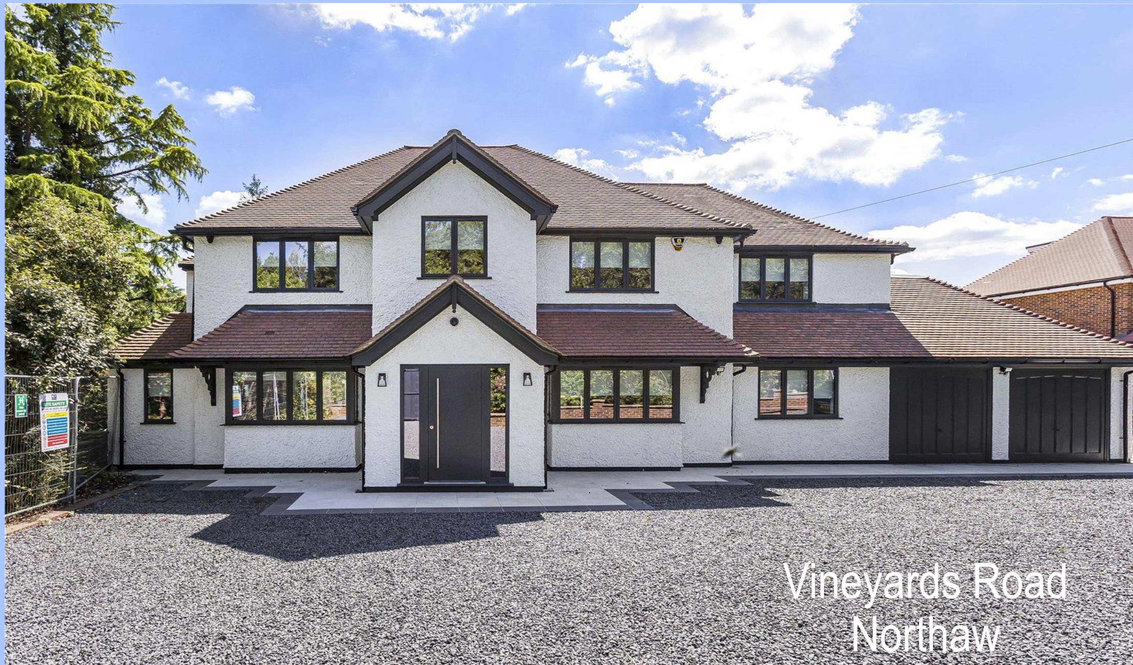
Vineyards Road Northaw