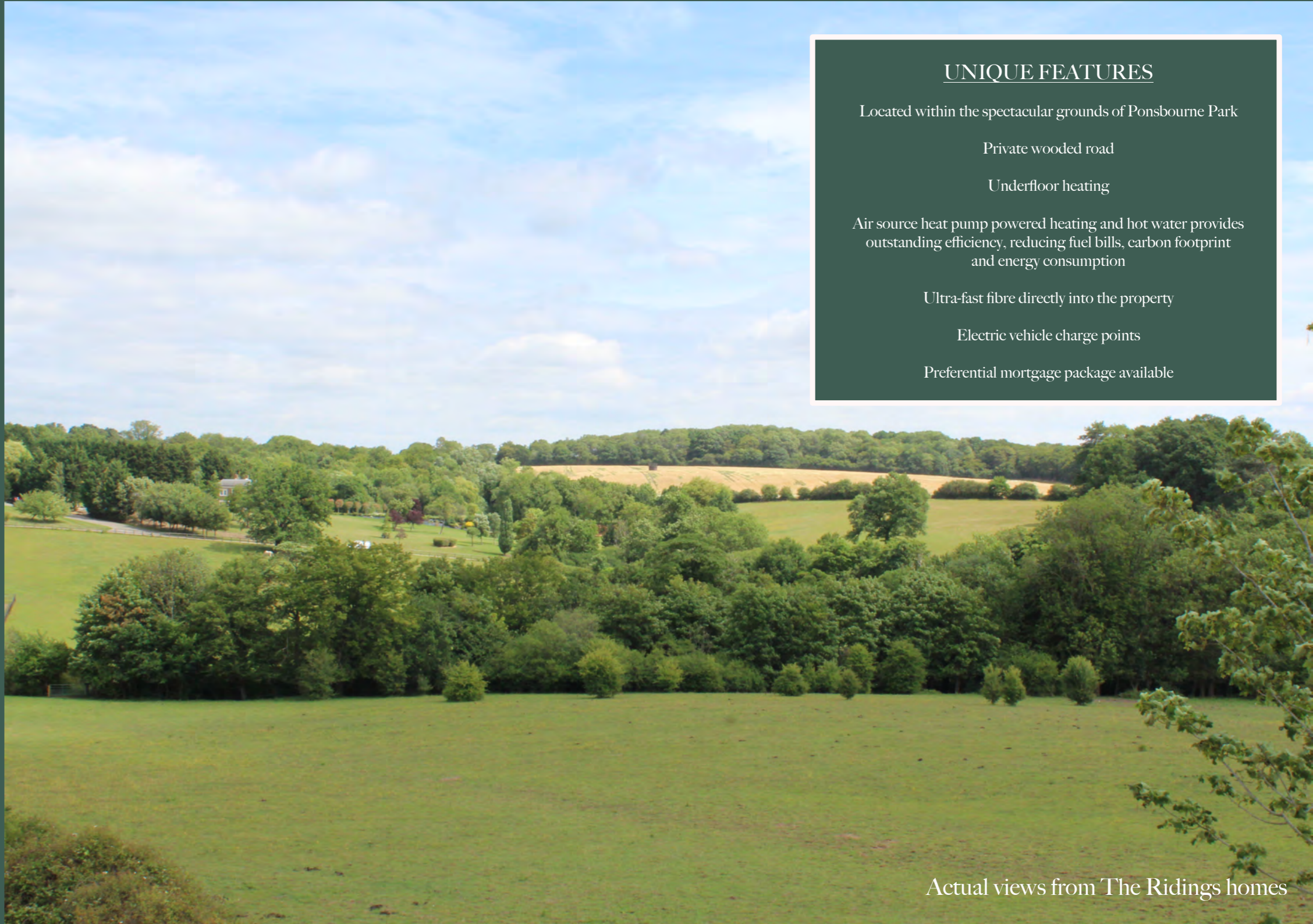
Actual views from The Ridings homes