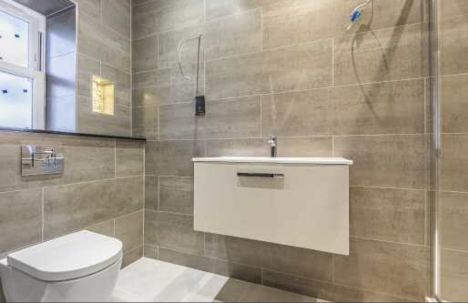
Bergamont House, Flat 5 52 Rowantree Road Enfield,