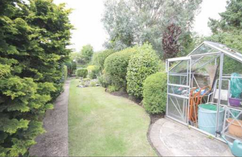
4 Clayton Cottages, 62 Barnet Road Arkley, Hertfordshire