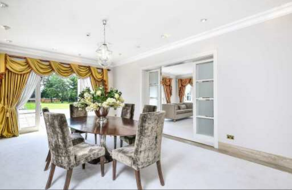
Little Dyrhams, Galley Lane Arkley, Hertfordshire EN5 4RA