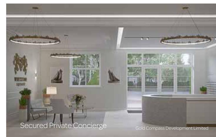
Secured Private Concierge