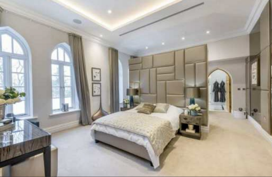
Chapel, 7 Holborn Close Mill Hill, London NW7 4AZ