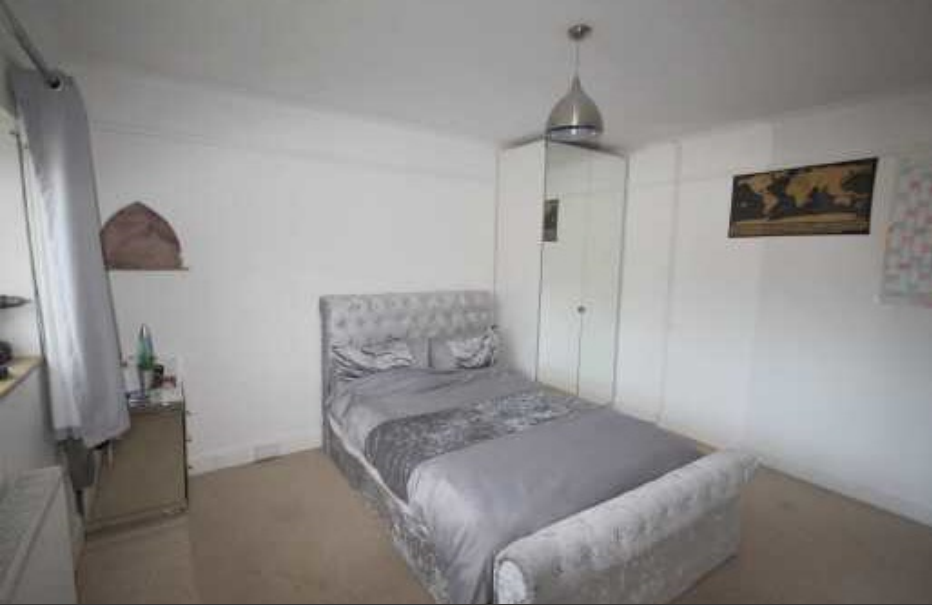
23 East View Hadley Green, Hertfordshire EN5 5TL