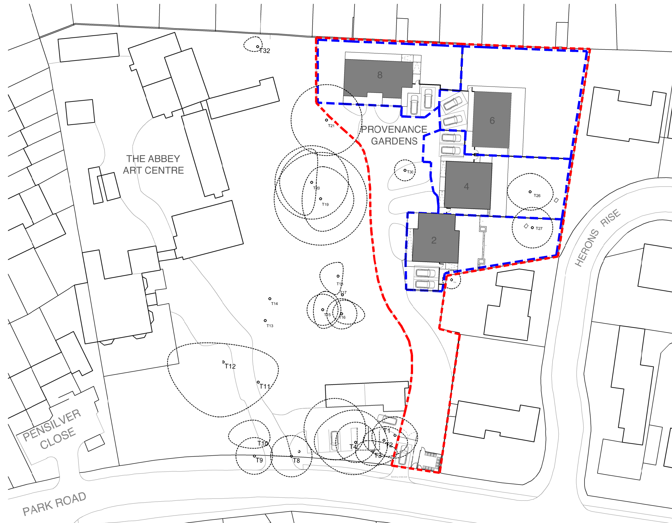
02 SITE PLAN SCALE: 1:500 @ A3

DISCLAIMER Dimensions to be verified on site. Only figured dimensions to be used and any discrepancies in dimensions are to be reported to Holloway and Holloway. No dimensions are to be scaled from printed drawings. Any areas indicated on this drawing are for guidance only. No responsibility is taken for their accuracy. There is a risk of injury or death in construction if works are not properly planned and supervised. The contractor must not undertake any elements of the work without first having carried out the necessary risk assessments and prepare detailed method statements.