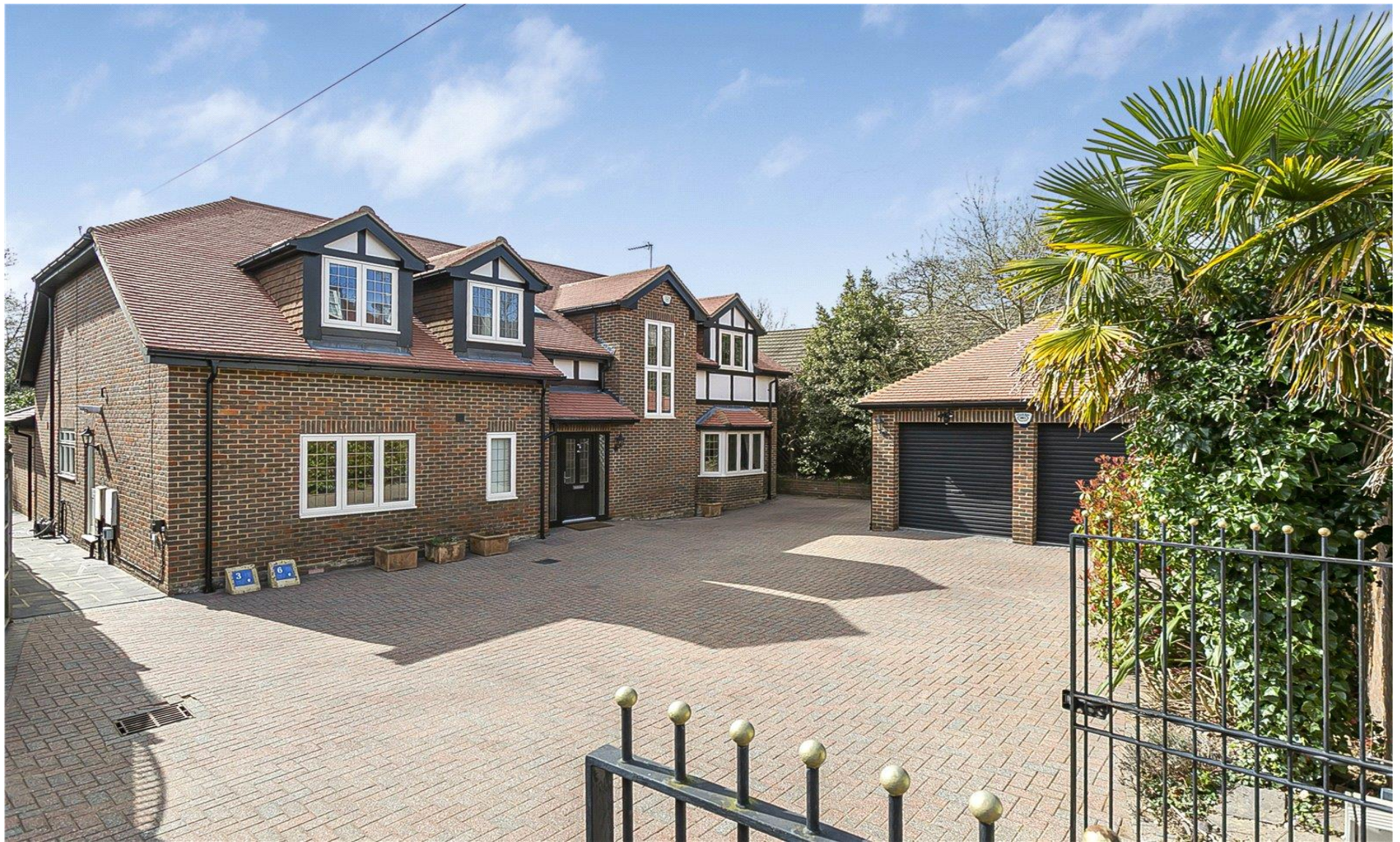
Beech Hill Hadley Wood, EN4 0JJ