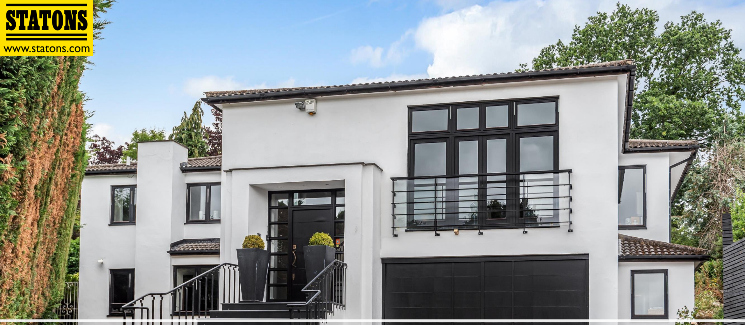
The Pastures, Totteridge, N20