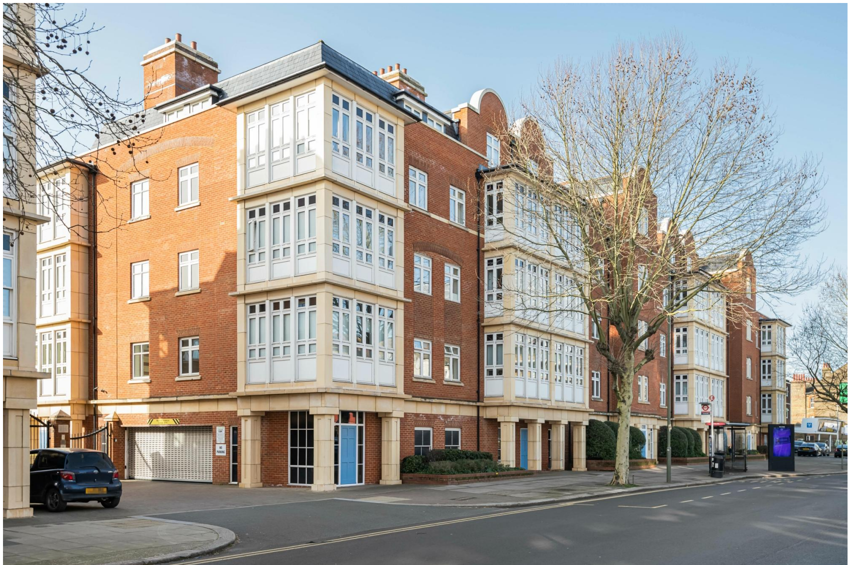
Hurley Court London, N12