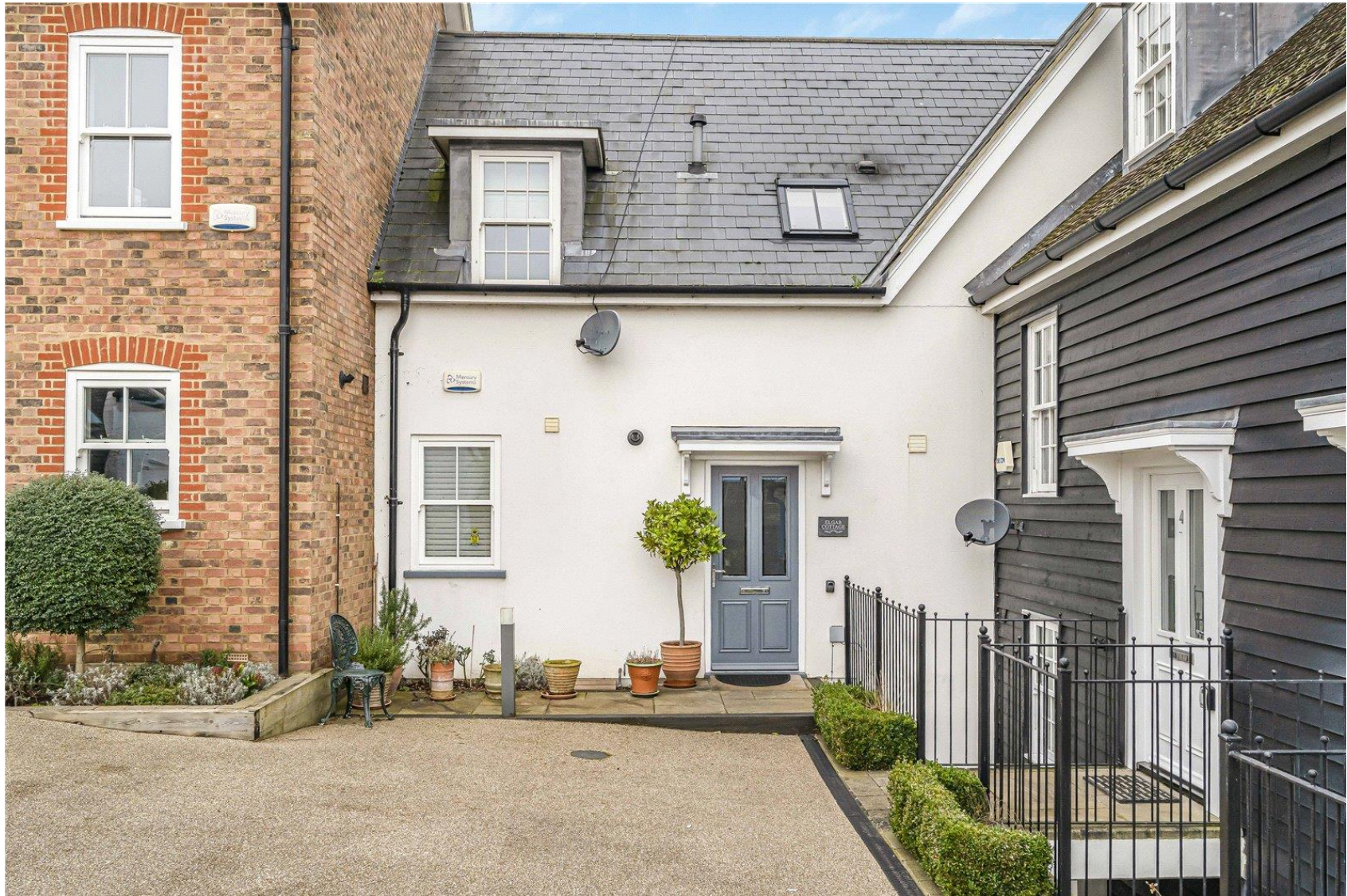
Orme Court Essendon AL9 6BP