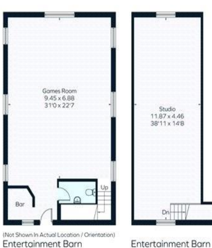
Entertainment Barn First Floor