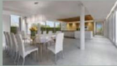
Dining Room and Kitchen