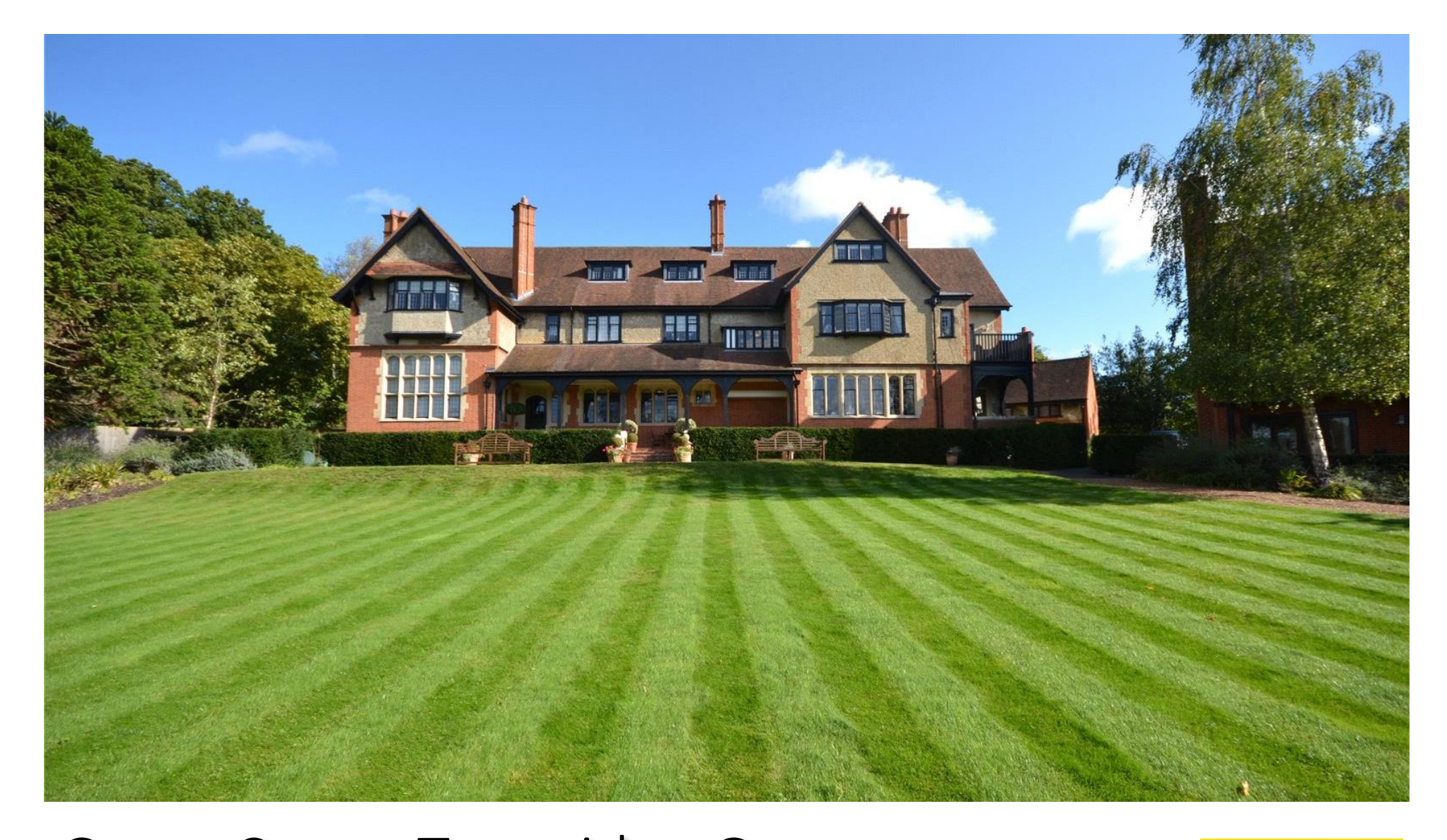
Grace Court, Totteridge Green Totteridge, London, N20 8PY