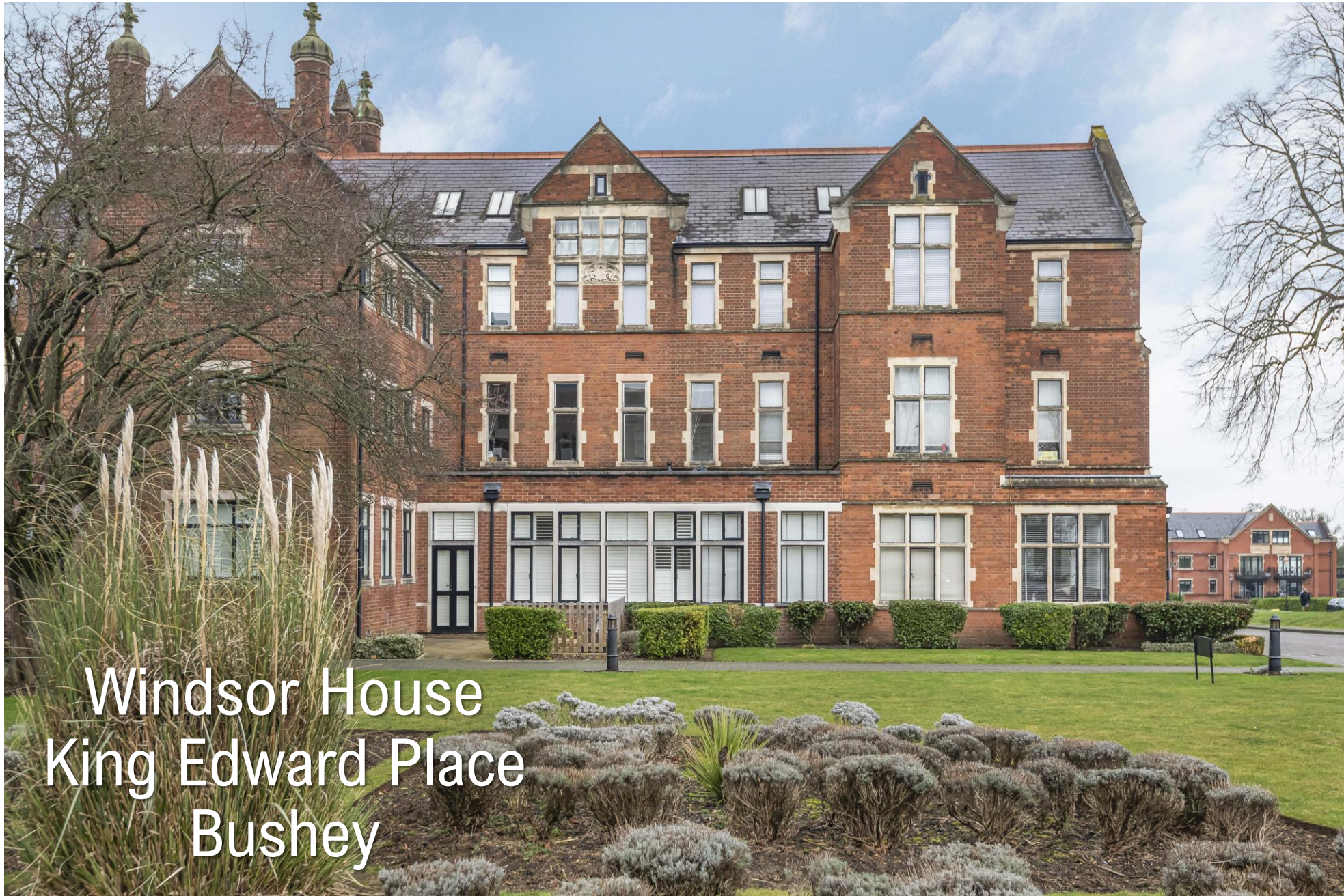
Windsor House King Edward Place Bushey