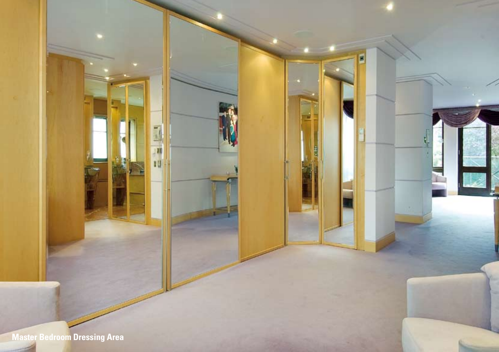
Master Bedroom Dressing Area