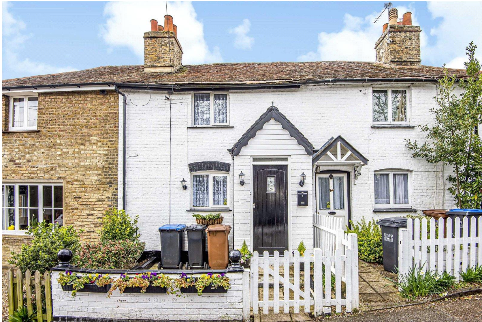
Church Lane Northaw EN6 4NX