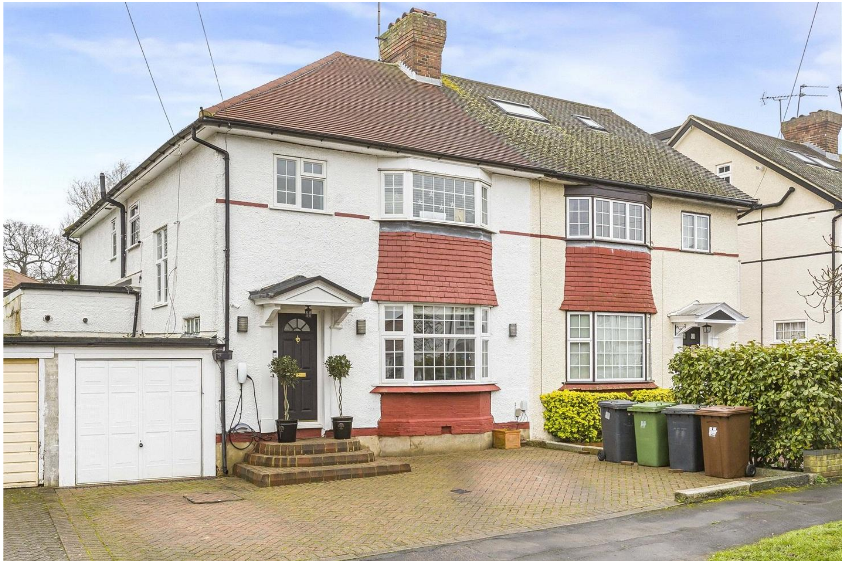
Strafford Gate Potters Bar EN6