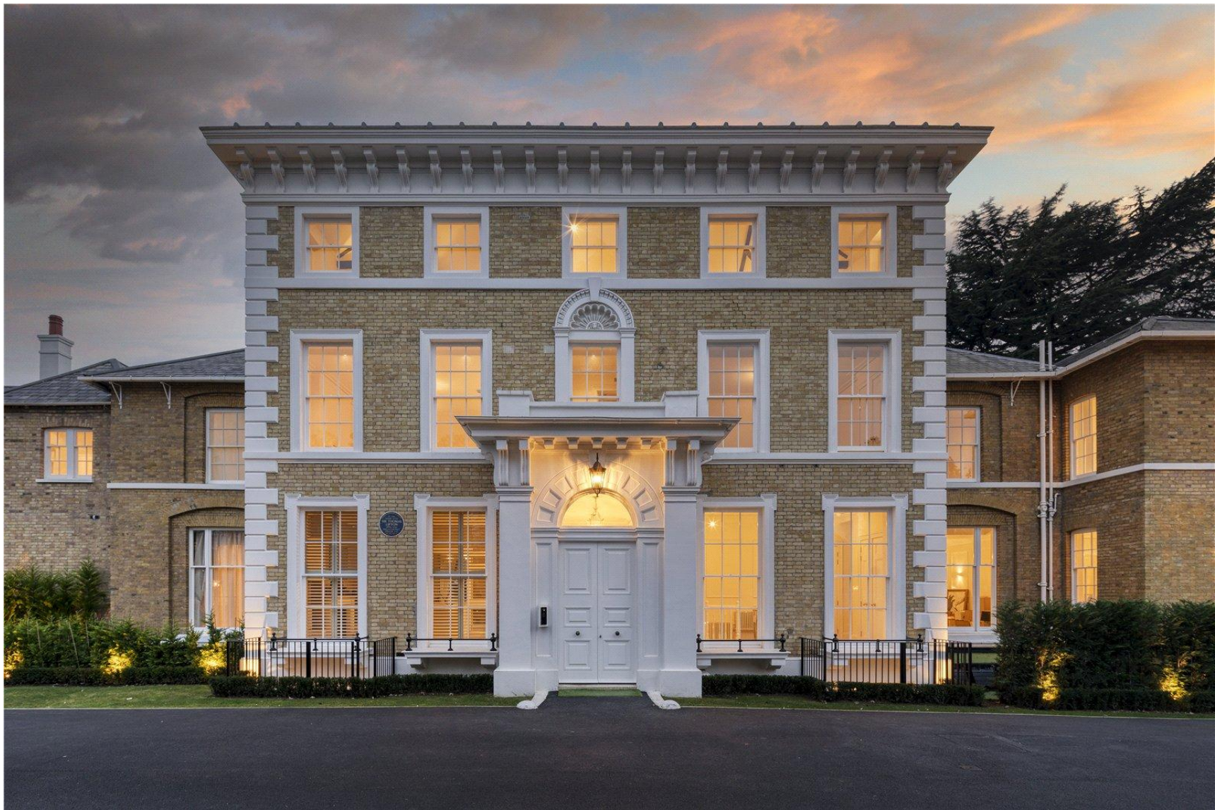
Lipton Close London, N14