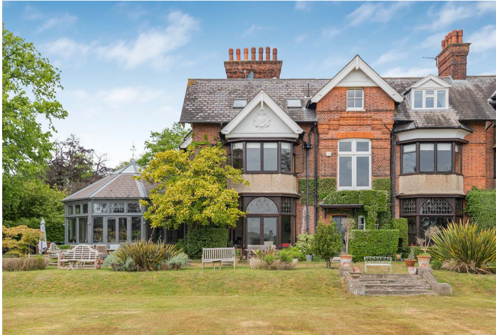
Robins Nest Hill Little Berkhamsted, SG13