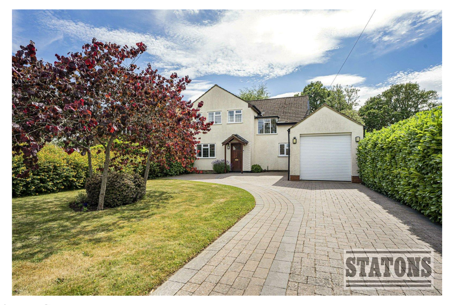
Pine Grove Brookmans Park, AL9 7BL