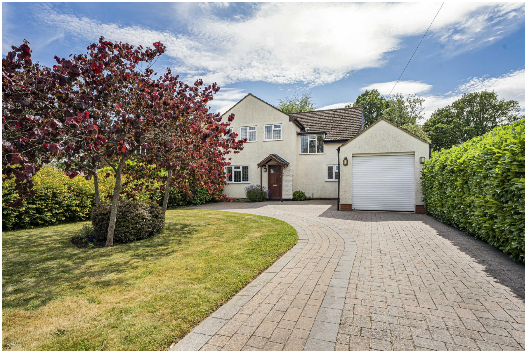
Pine Grove Brookmans Park AL9