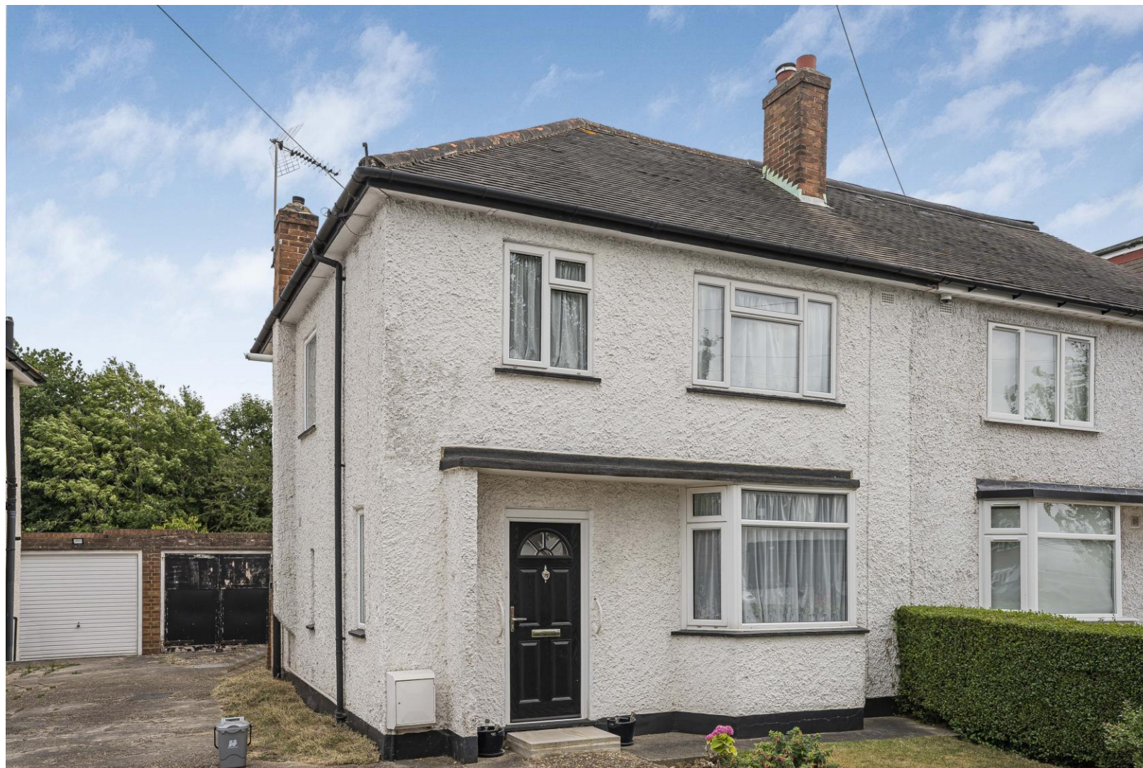
Windmore Avenue Potters Bar EN6