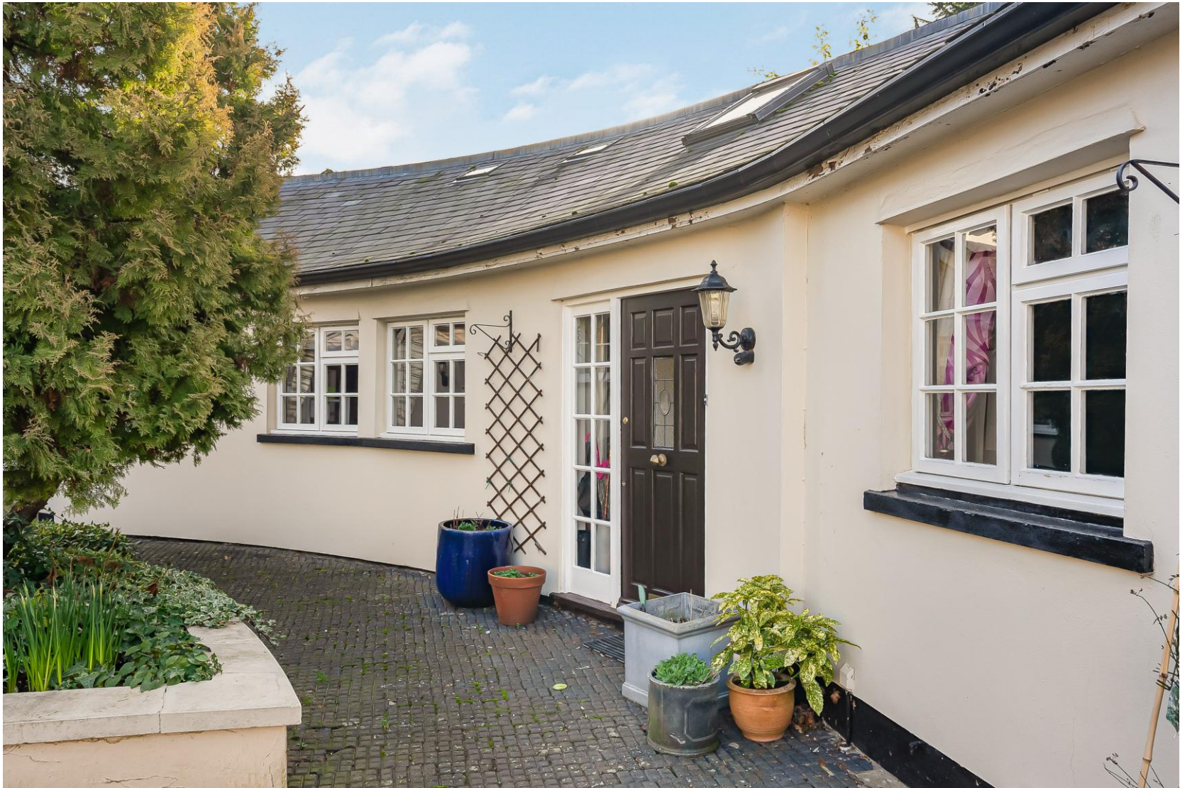
Tolmers Mews Newgate Street, Hertford SG13