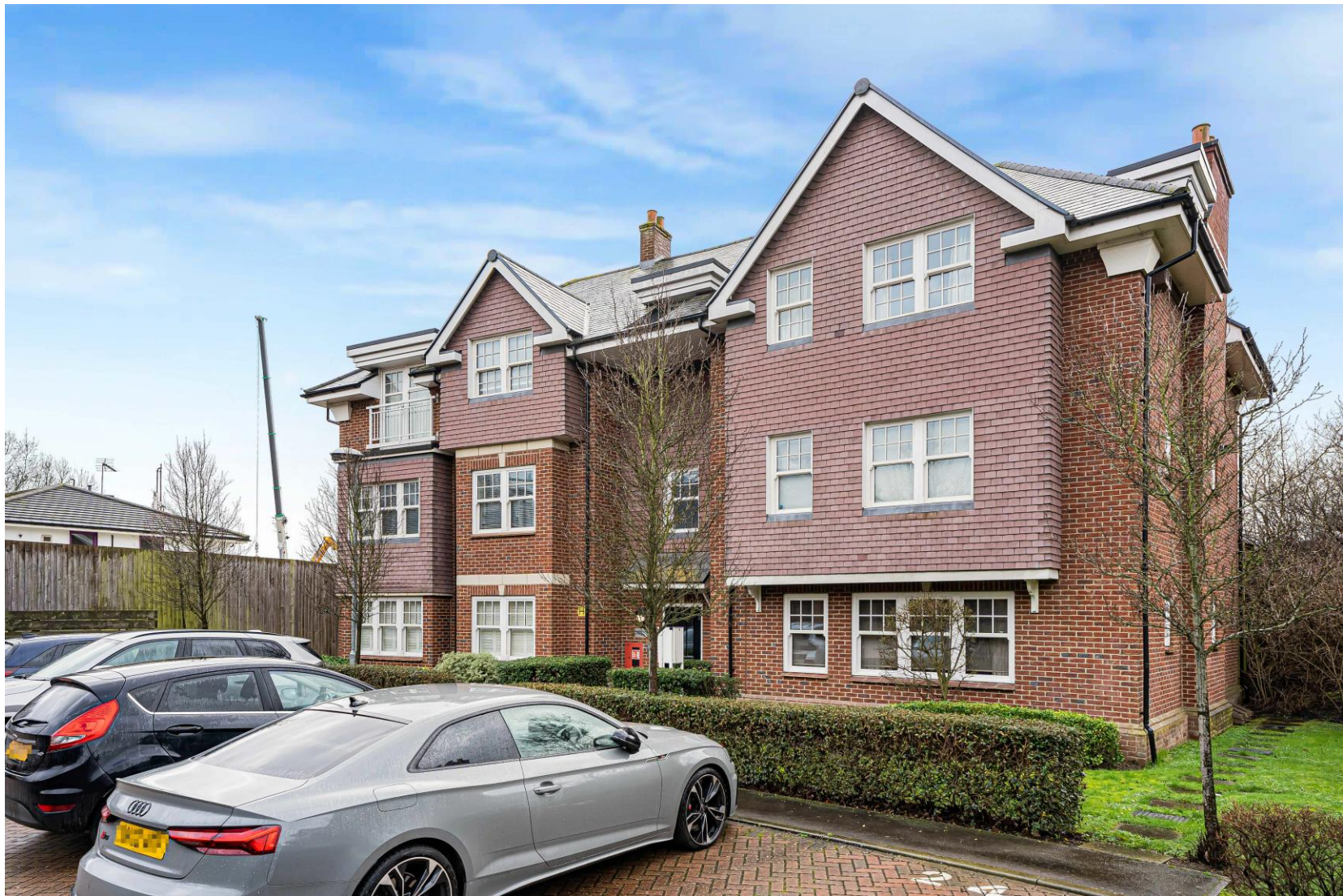
Palmerstone Court Mill Hill, NW7