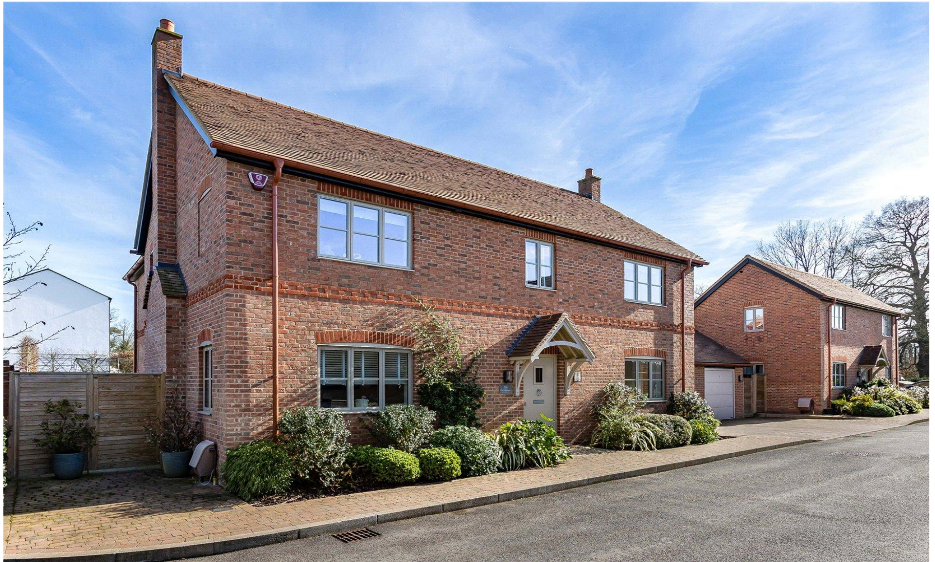
Northaw House Coopers Lane, EN6 4FG