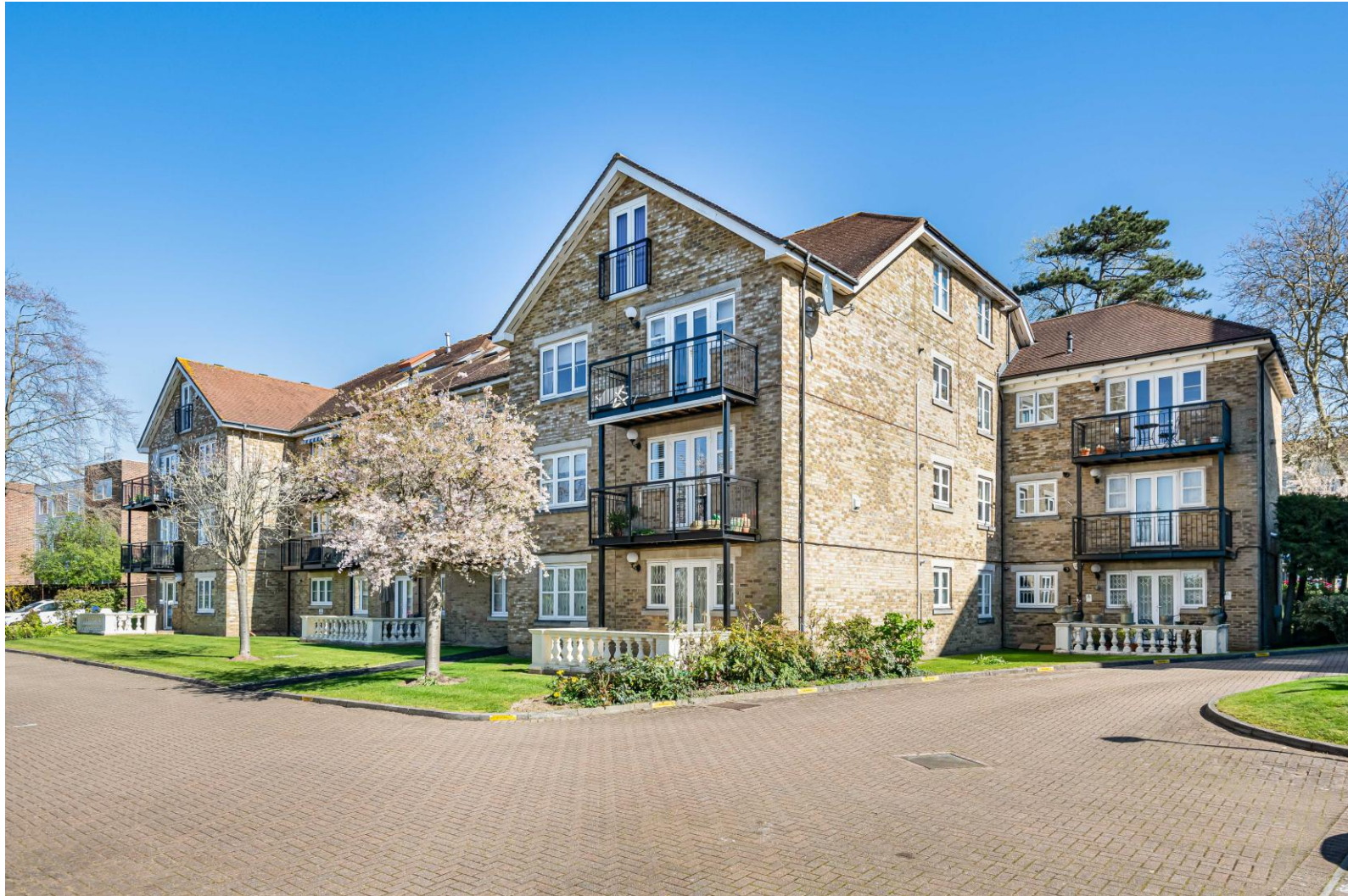
Fairmead Court High Road, Whetstone, N20